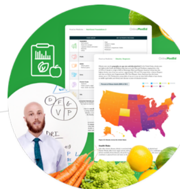
Food as Medicine